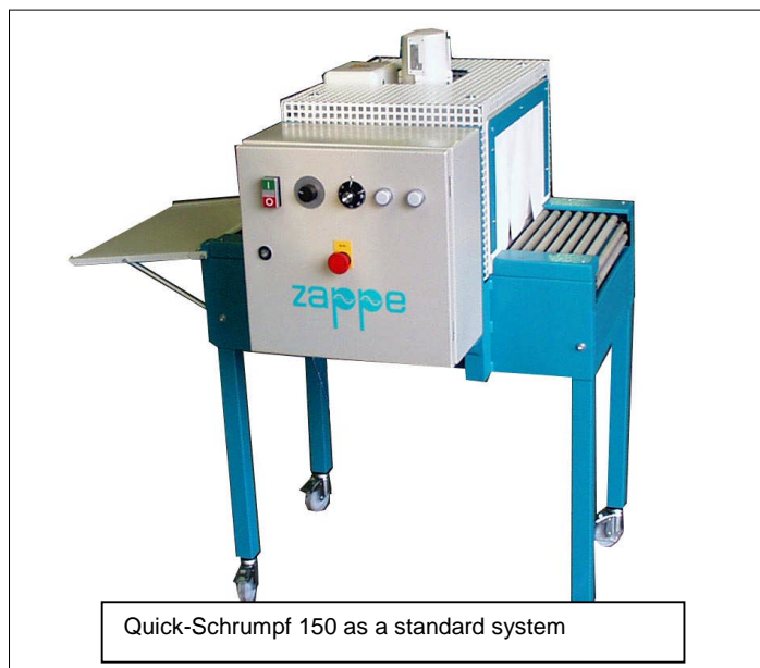
Quick-Schrumpf 150 as a standard system